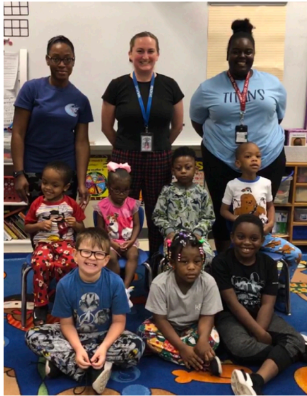
"There's No Place Like Home"

We loved wearing our pajamas to school during RHS Homecoming Week!